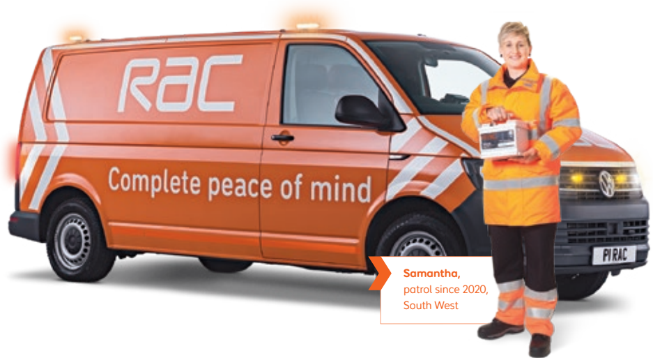
Samantha, patrol since 2020, South West